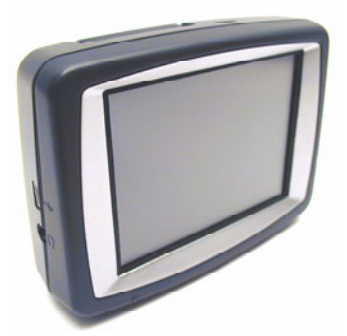
The iWAY 250c<sup>™</sup> GPS unit.

We have tried to make iWAY operation as simple as possible. After pushing the power button you will use the iWAY's touch screen to control all of its functions.