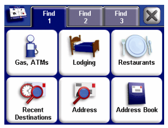
The iWAY Find Menu.

The Go To command is the easiest way to generate a route but we provide several other options which can be found by choosing the F ind button from the Main Menu.