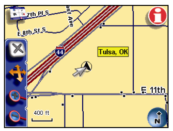
At left, Map Mode display zoomed out. At right, Map Mode display zoomed in with cursor arrow up and Map Display Toolbar buttons showing. Map Orientation button at bottom right indicates North Up.

There are three different ways to view the map. The Map Orientation button can be found in the bottom right corner of the screen whenever the map display toolbar is active. Touch this button to toggle between North Up, Track Up and 3D Mode. Practice with each of the modes and find out which one is right for you.