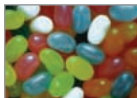
1-chip DLP™ Projector

1-chip DLP™ (Digital Light Processing™) is a trademark of Texas Instruments Incorporated.