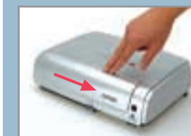
Close Slide, A/V Mute