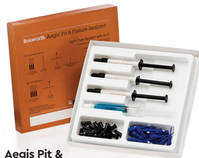
Aegis Pit & Fissure Sealant

Available in spearmint, bubble gum, and caramel flavors, Cargus