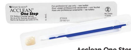
Acclean One Step 5% Sodium-Fluoride Varnish

International's MARK3 5% Sodium Fluoride Varnish features a smooth formula that dries clear. MARK3 is formulated with tricalcium phosphate to prevent caries and promote remineralization. It also contains desensitizing properties when applied to enamel and dentin surfaces.